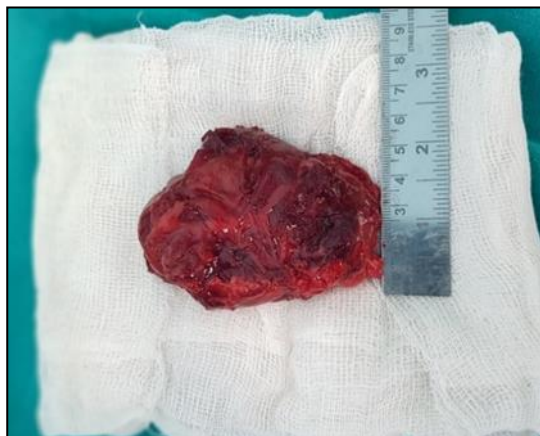
Fig 3: The excised tissue mass measuring 7cm x 5cm.