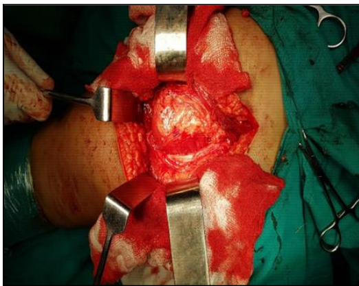
Fig 2: Soft tissue mass exposed extending into left hip joint.